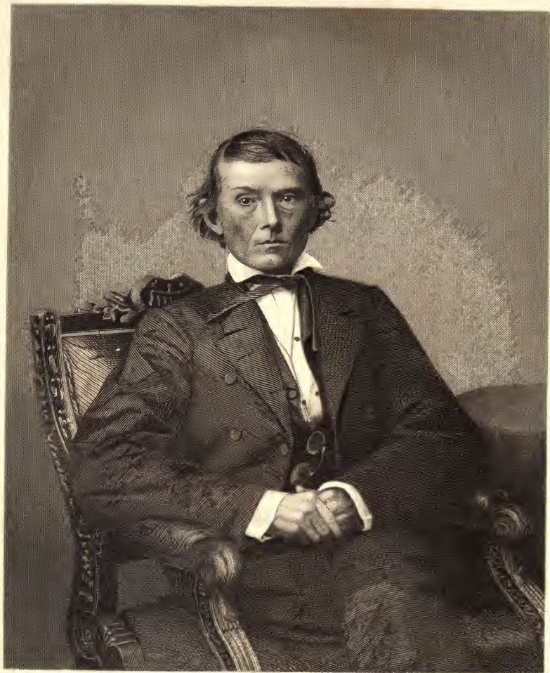
Engraved by E. Whitehead